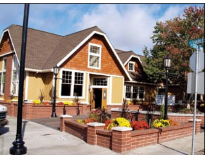
Mt. Angel's new library is a great resource for area residents.