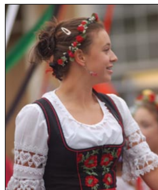
Dancer at Oktoberfest