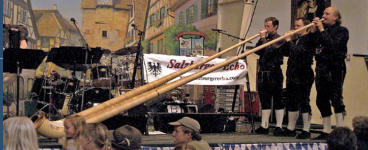
Entertainment abounds at Oktoberfest.

M ount Angel — a small, rural community (population 3,755) is situated in the beautiful Willamette Valley about 17 miles northeast of Salem, and 35 miles south of Portland. The Mt. Angel area is largely devoted to farming and nurseries. Vegetable row crops, many kinds of berries, and hops abound here. There are several small wineries nearby and many Christmas tree farms in the surrounding hills.